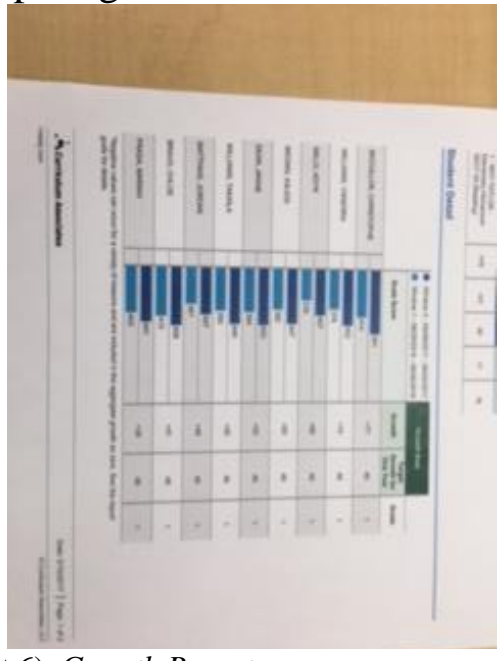
(Exhibit 6) Growth Report

Week 15 – Students in both kindergarten and first grade target group took their final assessment to measure the growth they experienced during this adventure. The diagnostic reflects the growth between the first test which was taken in September and compared with the third window. The growth report indicates that the program was a success, showing significant growth for more than 80% of the students participating.