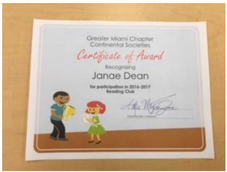
Program certificates were given to each student along with 2 I Can Read books to read over the siummer.