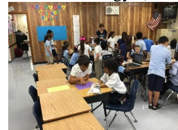
Fourth and Fifth grade gifted students assisting the kindergarten and first graders use laptops to log into iReady program.