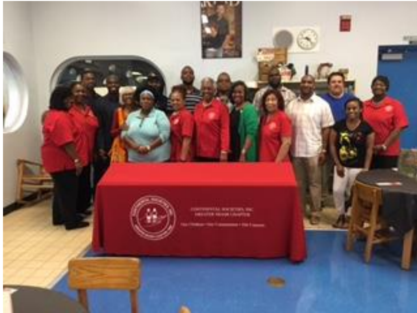
Parents and community leaders along with sisters from Greater Miami chapter were invited to share stories written by African American authors to the students of Cutler Ridge Elementary. (Exhibit 5)

Week 15 – Students in both kindergarten and first grade target group took their final assessment to measure the growth they experienced during this adventure. The diagnostic reflects the growth between the first test which was taken in September and compared with the third window. The growth report indicates that the program was a success, showing significant growth for more than 80% of the students participating.