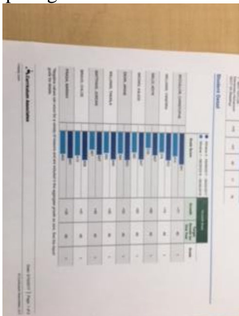
(Exhibit 6) Growth Report

Week 15 – Students in both kindergarten and first grade target group took their final assessment to measure the growth they experienced during this adventure. The diagnostic reflects the growth between the first test which was taken in September and compared with the third window. The growth report indicates that the program was a success, showing significant growth for more than 80% of the students participating.